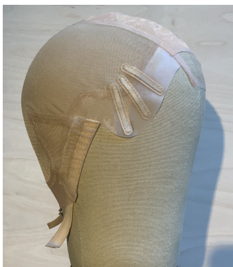
LUXE ARIA™ BASE

Our collection features our luxurious Euroblend hair in 15-16" length providing unlimited options for medium to long hairstyles.