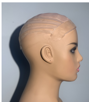
YOUTH CUT-A-WAY™ BASE