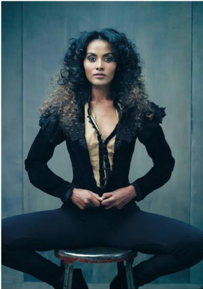
SHERRI RENEE COUTURE COLLECTION